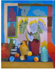
DANIEL GORDON Still Life with Oranges, Vessels, and House Plant, 2016 PIGMENT PRINT ON LUSTER PAPER ED. OF 3 + 1 AP 126.4 X 101 CM ( 49 3/4 X 39 3/4 INCH ) GORDO571016