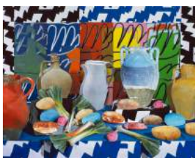
DANIEL GORDON Potatoes and Leeks , 2016 PIGMENT PRINT ON LUSTER PAPER ED. OF 3 + 1 AP 101 X 126.4 CM ( 39 3/4 X 49 3/4 INCH ) GORDO571018