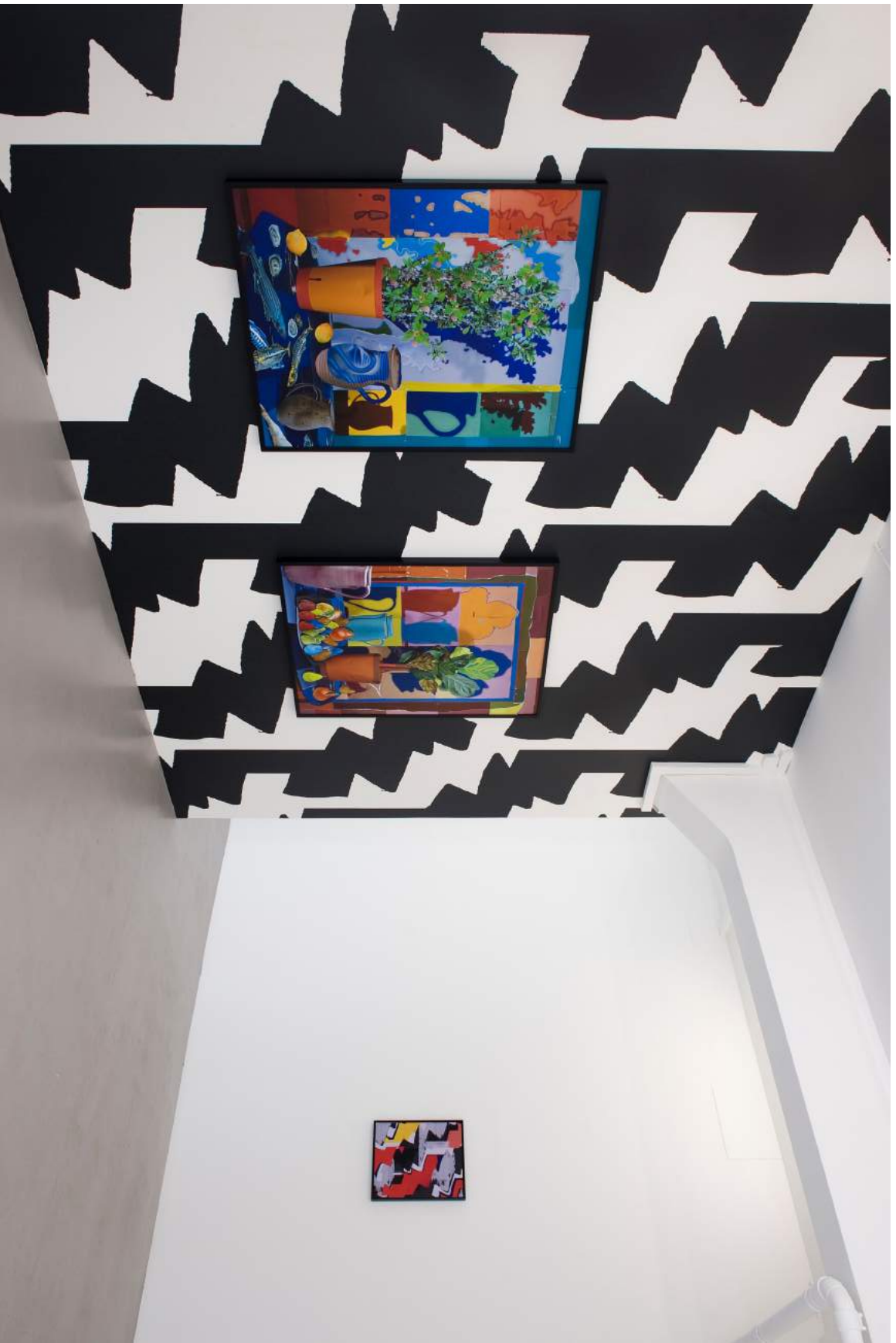
Installation view Hand, Select & Invert Layer