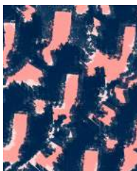
DANIEL GORDON Screen Selection 13 , 2016 PIGMENT PRINT ON CANVAS UNIQUE 50.8 x 40.5 CM ( 20 X 16 INCH ) GORDO571022