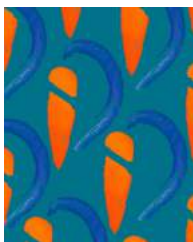
DANIEL GORDON Screen Selection 9 , 2016 PIGMENT PRINT ON CANVAS UNIQUE 50.8 x 40.5 CM ( 20 X 16 INCH ) GORDO571027