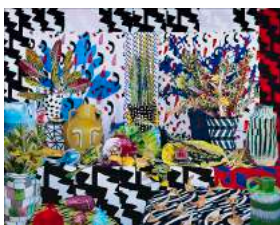
DANIEL GORDON Still Life with Zig-Zags in Black and Red , 2015 PIGMENT PRINT ON LUSTER PAPER ED. 3/3 + 1 AP 150.5 X 188 CM ( 59 1/4 X 74 INCH ) GORDO573831