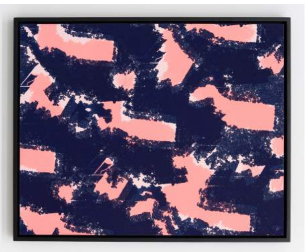
Screen Selection 13, 2016, pigment print on canvas, unique, 50.8 x 40.5 cm