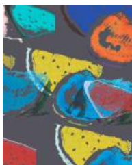
DANIEL GORDON Screen Selection 14 , 2016 PIGMENT PRINT ON CANVAS UNIQUE 50.8 x 40.5 CM ( 20 X 16 INCH ) GORDO571021