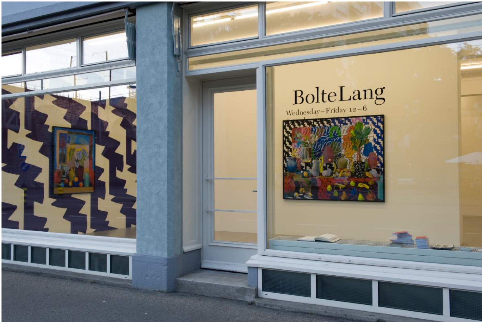
Installation view Hand, Select & Invert Layer