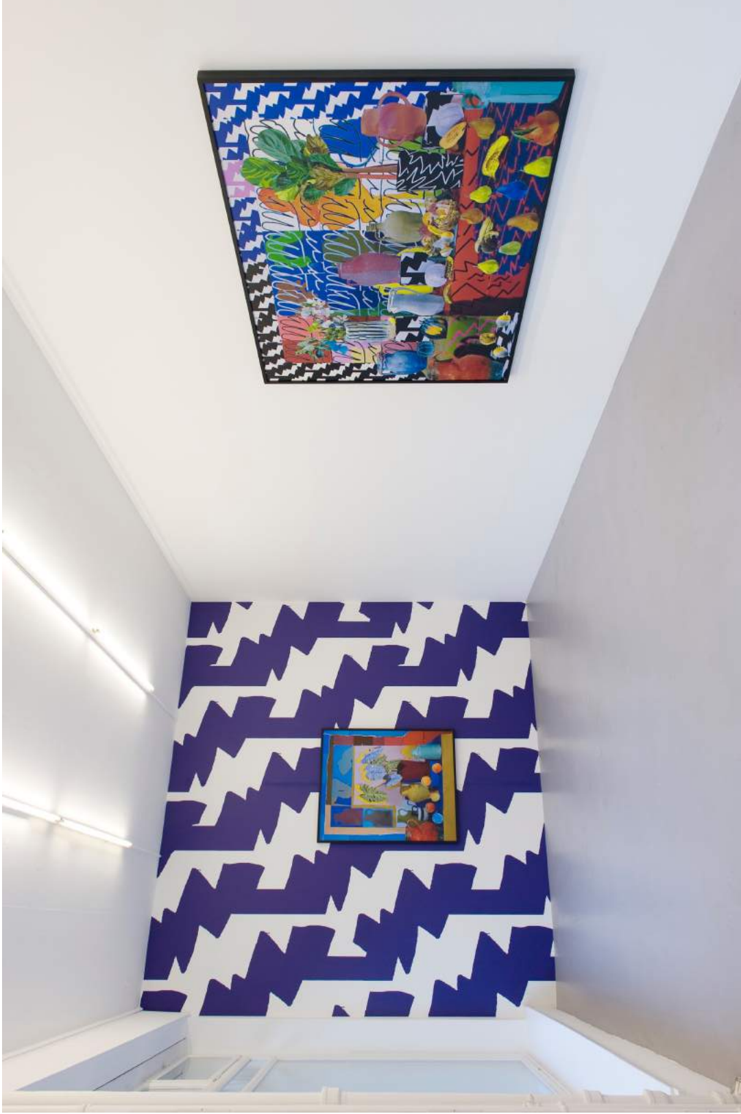
Installation view Hand, Select & Invert Layer