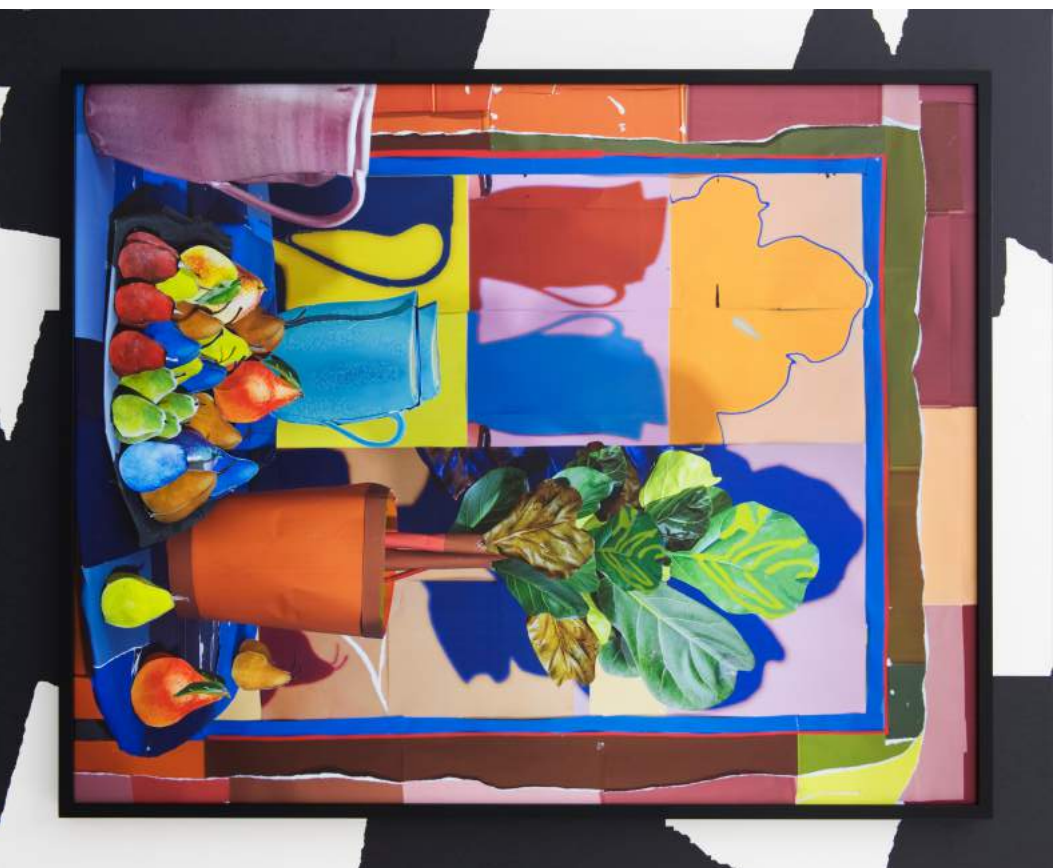
Fiddle Leaf Ficus and Pears , 2016, pigment print on luster paper, ed. of 3 + 1 AP, 126.4 x 101 cm