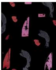
DANIEL GORDON Screen Selection 12 , 2016 PIGMENT PRINT ON CANVAS UNIQUE 50.8 x 40.5 CM ( 20 X 16 INCH ) GORDO571023