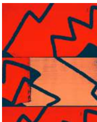
DANIEL GORDON Screen Selection 10 , 2016 PIGMENT PRINT ON CANVAS UNIQUE 50.8 x 40.5 CM ( 20 X 16 INCH ) GORDO571026