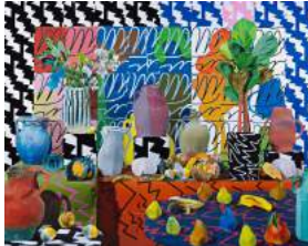
DANIEL GORDON Still Life with Fruit and Ficus, 2016 PIGMENT PRINT ON LUSTER PAPER ED. 1/3 + 1 AP 150.5 X 188 CM ( 59 1/4 X 74 INCH ) GORDO571017