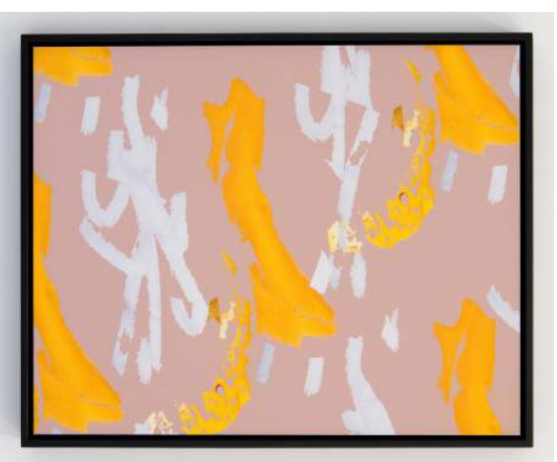
Screen Selection 7, 2016, pigment print on canvas, unique, 50.8 x 40.5 cm