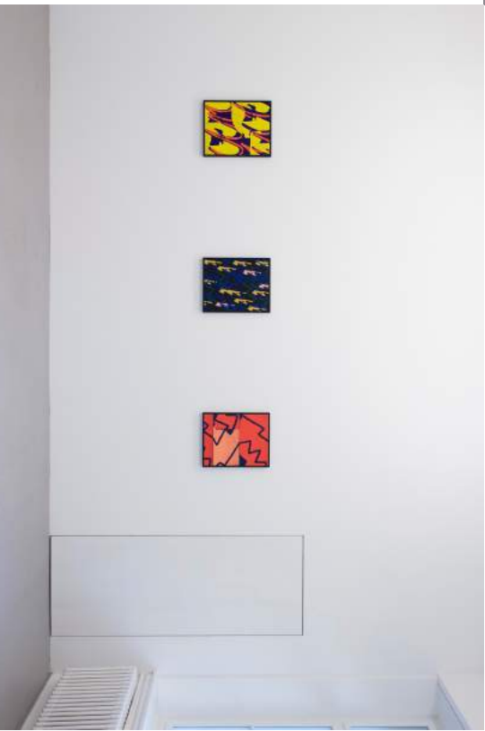
Installation view Hand, Select & Invert Layer