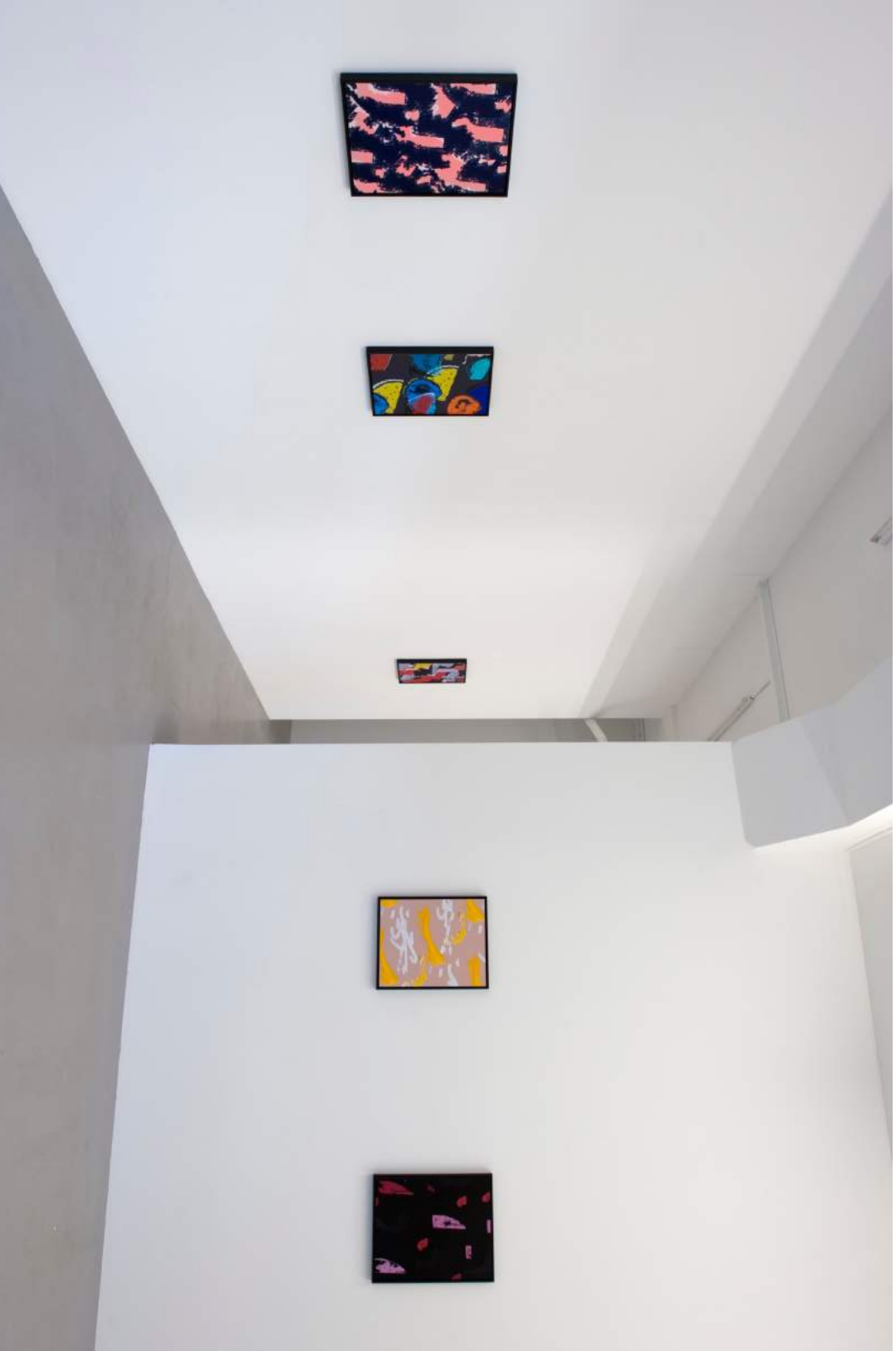
Installation view Hand, Select & Invert Layer