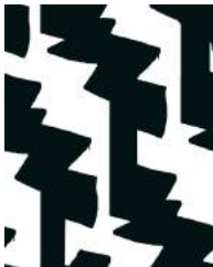
DANIEL GORDON Zig-Zag in Black, 2016 WALLPAPER UNIQUE + EC SITE SPECIFIC GORDO571030