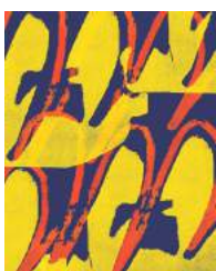
DANIEL GORDON Screen Selection 15 , 2016 PIGMENT PRINT ON CANVAS UNIQUE 50.8 x 40.5 CM ( 20 X 16 INCH ) GORDO571020