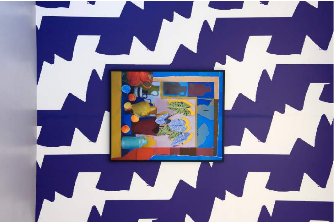
Still Life with Oranges, Vessels, and House Plant , 2016, pigment print on luster paper, ed. of 3 + 1 AP, 126.4 x 101 cm

Zig-Zag in Blue , 2016, wallpaper, unique + EC, site specific