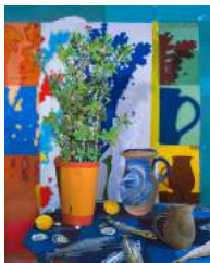
DANIEL GORDON Still Life with Fish and Oysters, 2016 PIGMENT PRINT ON LUSTER PAPER ED. 1/3 + 1 AP 126.4 X 101 CM ( 49 3/4 X 39 3/4 INCH ) GORDO571015