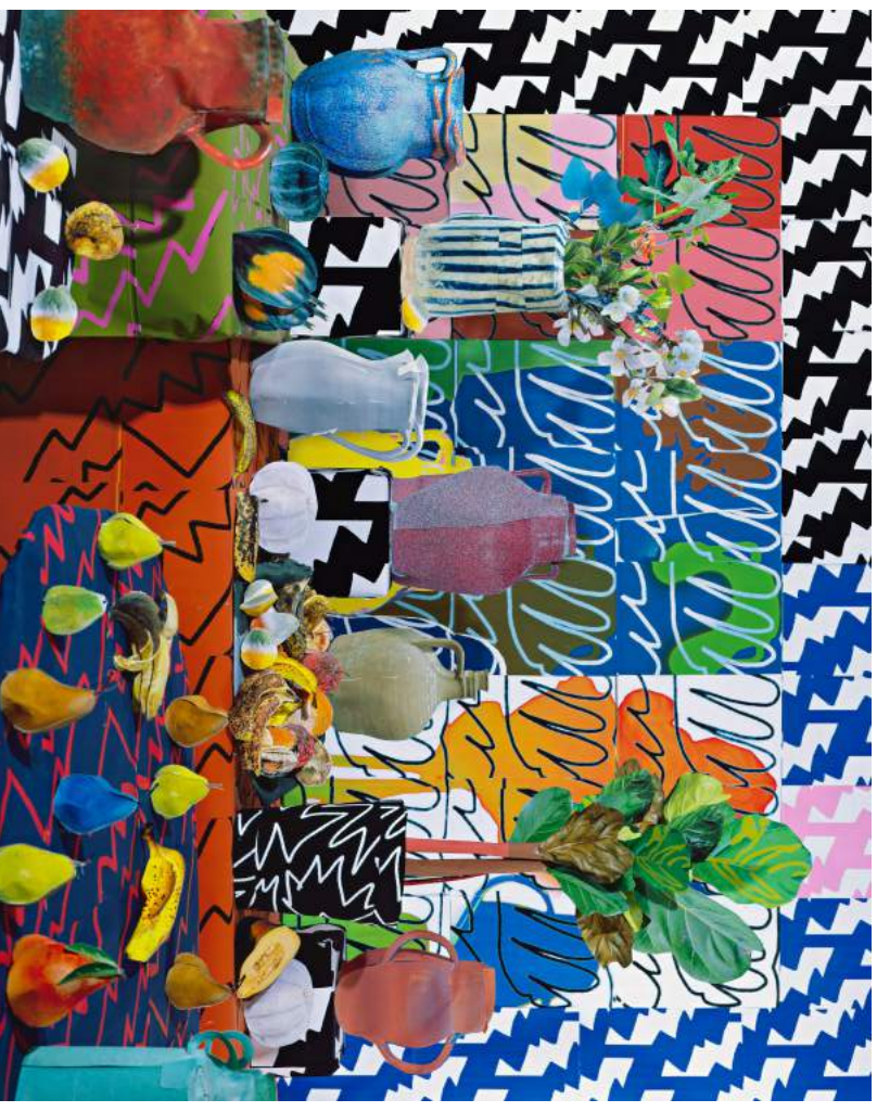
Still Life with Fruit and Ficus , 2016, pigment print on luster paper, ed. 1/3 + 1 AP, 150.5 x 188 cm

Zig-Zag in Blue , 2016, wallpaper, unique + EC, site specific