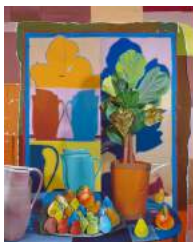
DANIEL GORDON Fiddle Leaf Ficus and Pears, 2016 PIGMENT PRINT ON LUSTER PAPER ED. OF 3 + 1 AP 126.4 X 101 CM ( 49 3/4 X 39 3/4 INCH ) GORDO571014