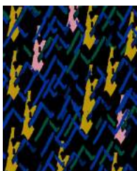
DANIEL GORDON Screen Selection 16 , 2016 PIGMENT PRINT ON CANVAS UNIQUE 50.8 x 40.5 CM ( 20 X 16 INCH ) GORDO571025