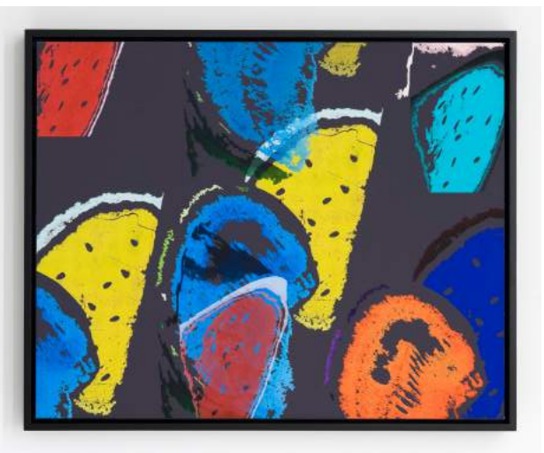
Screen Selection 14, 2016, pigment print on canvas, unique, 50.8 x 40.5 cm