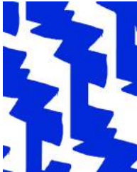
DANIEL GORDON Zig-Zag in Blue, 2016 WALLPAPER UNIQUE + EC SITE SPECIFIC GORDO571029