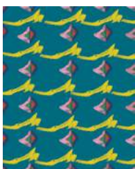
DANIEL GORDON Screen Selection 8 , 2016 PIGMENT PRINT ON CANVAS UNIQUE 50.8 x 40.5 CM ( 20 X 16 INCH ) GORDO571028