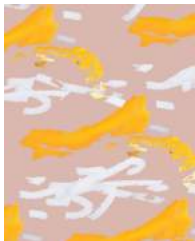
DANIEL GORDON Screen Selection 7 , 2016 PIGMENT PRINT ON CANVAS UNIQUE 50.8 x 40.5 CM ( 20 X 16 INCH ) GORDO571019