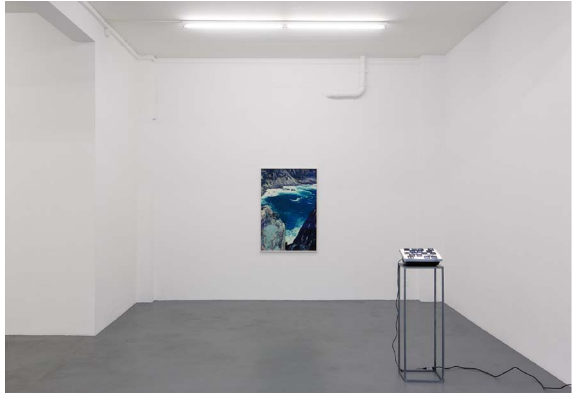
Installation view The Pleasant Shore