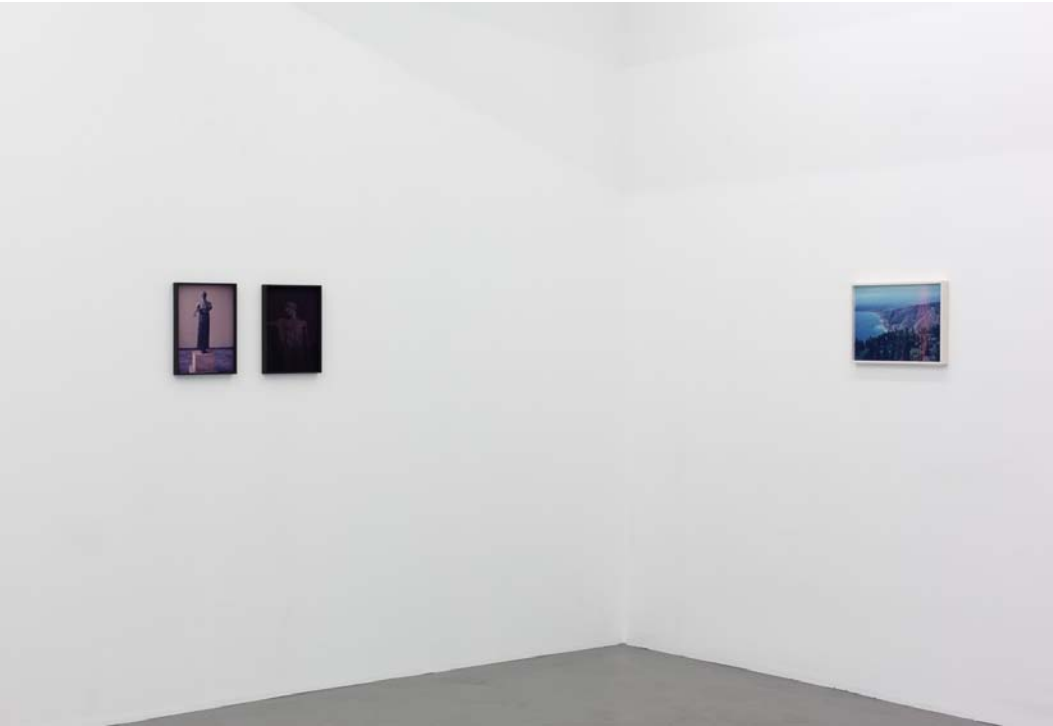
Installation views The Pleasant Shore