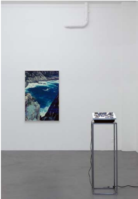
Installation view The Pleasant Shore