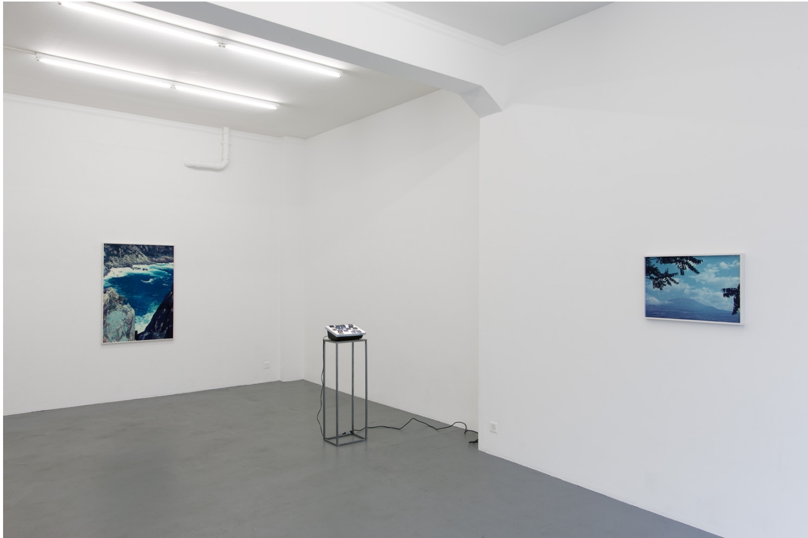
Installation view The Pleasant Shore