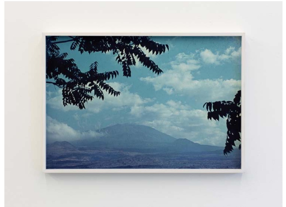
Untitled (Etna) , 2015, c-print, ed. of 5 + 2 AP, 43 x 62 cm framed