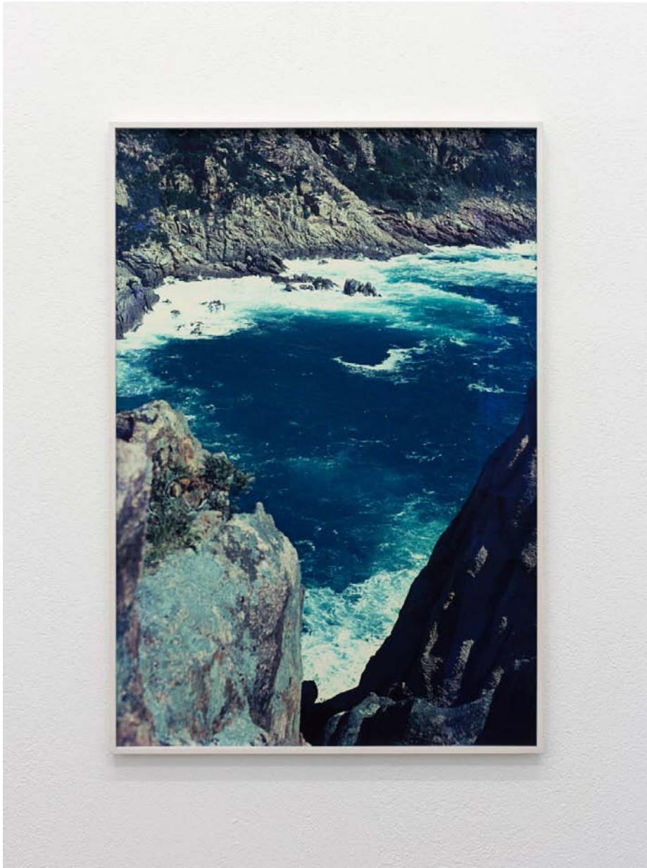
Untitled (Bay) , 2015, c-print, ed. of 5 + 2 AP, 122 x 84 cm framed