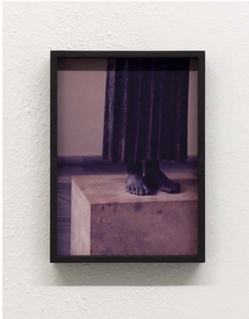
Untitled (Statue) #3 , 2015, c-print, ed. of 5 + 2 AP, 17 x 23,4 cm framed