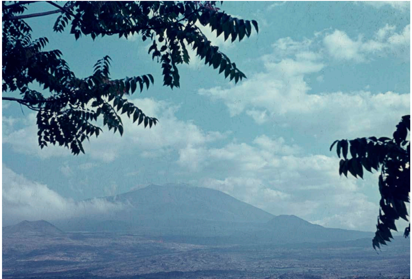
Untitled (Etna) , 2015, c-print, ed. of 5 + 2 AP, 43 x 62 cm framed