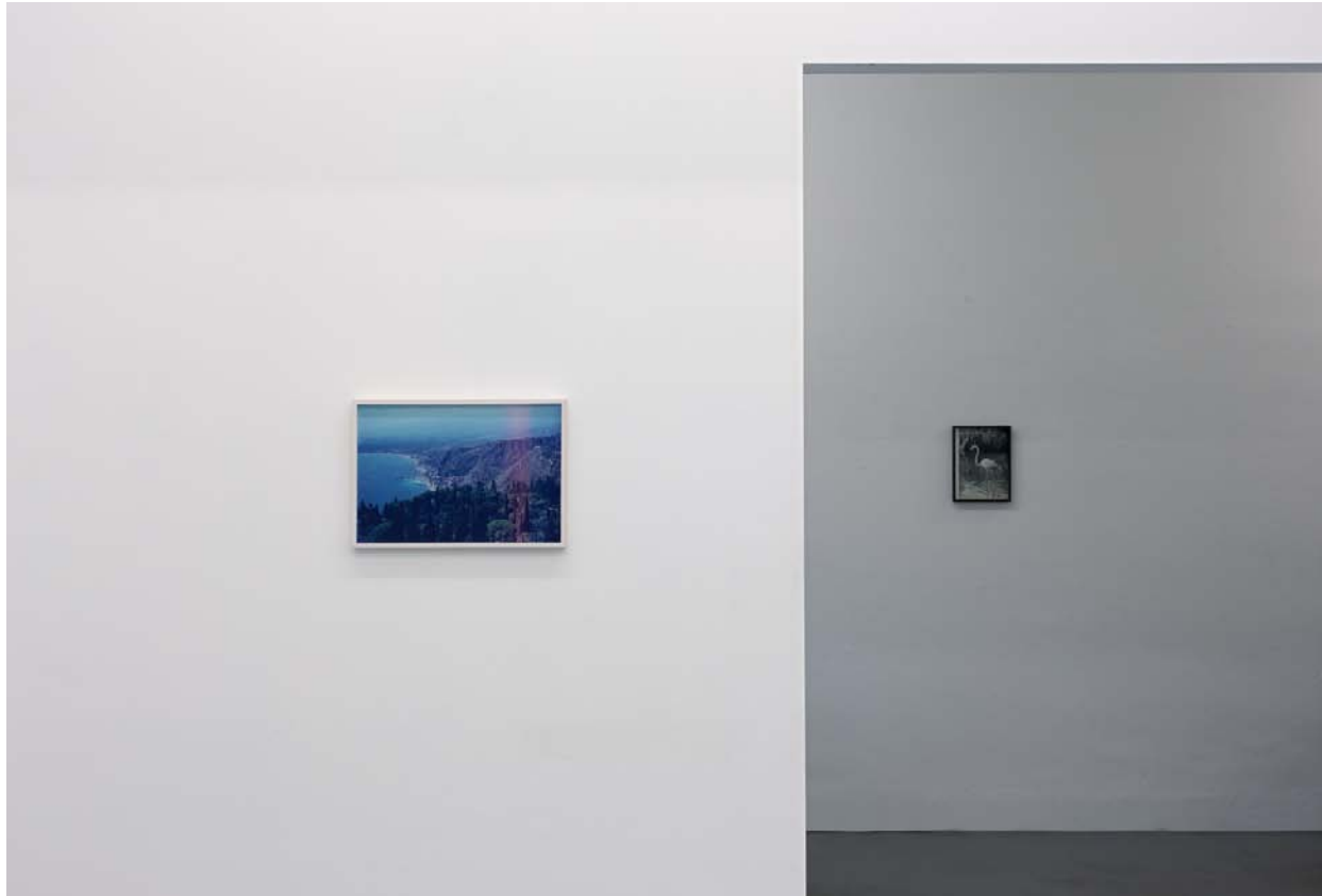
Installation view The Pleasant Shore