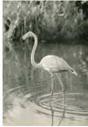
TALISA LALLAI Der gewöhnliche Flamingo (Phoenicopterus ruber roseus), 2015 C-print Ed. 1/5 + 2 AP 31.4 x 23.7 cm ( 12 3/8 x 9 3/8 inch ) framed LALLA554449