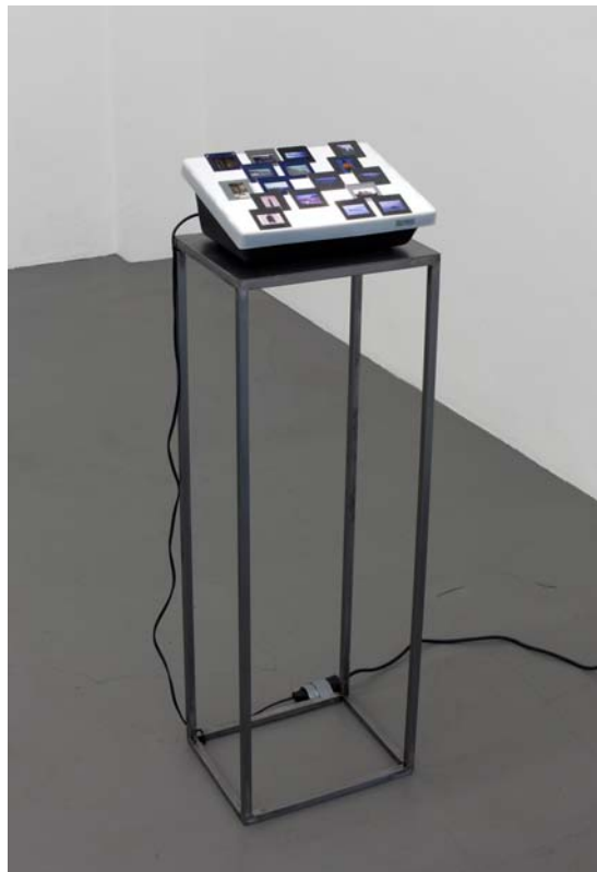
17 Slides , 2015, Dia display, 108 x 33 x 26 cm