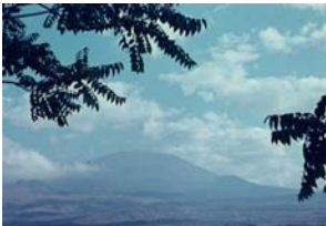
TALISA LALLAI Untitled (Etna), 2015 C-print Ed. 1/5 + 2 AP 43 x 62 cm ( 16 7/8 x 24 3/8 inch ) framed LALLA554442