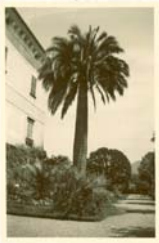
TALISA LALLAI Isola madre, 2015 Silver gelatin print Unique 9.2 x 6.2 cm ( 3 5/8 x 2 1/2 inch )Framed: 31,4 x 24,4 cm LALLA554450