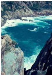
TALISA LALLAI Untitled (Bay), 2015 C-print Ed. 1/5 + 2 AP 122 x 84 cm ( 48 x 33 1/8 inch ) framed LALLA554441