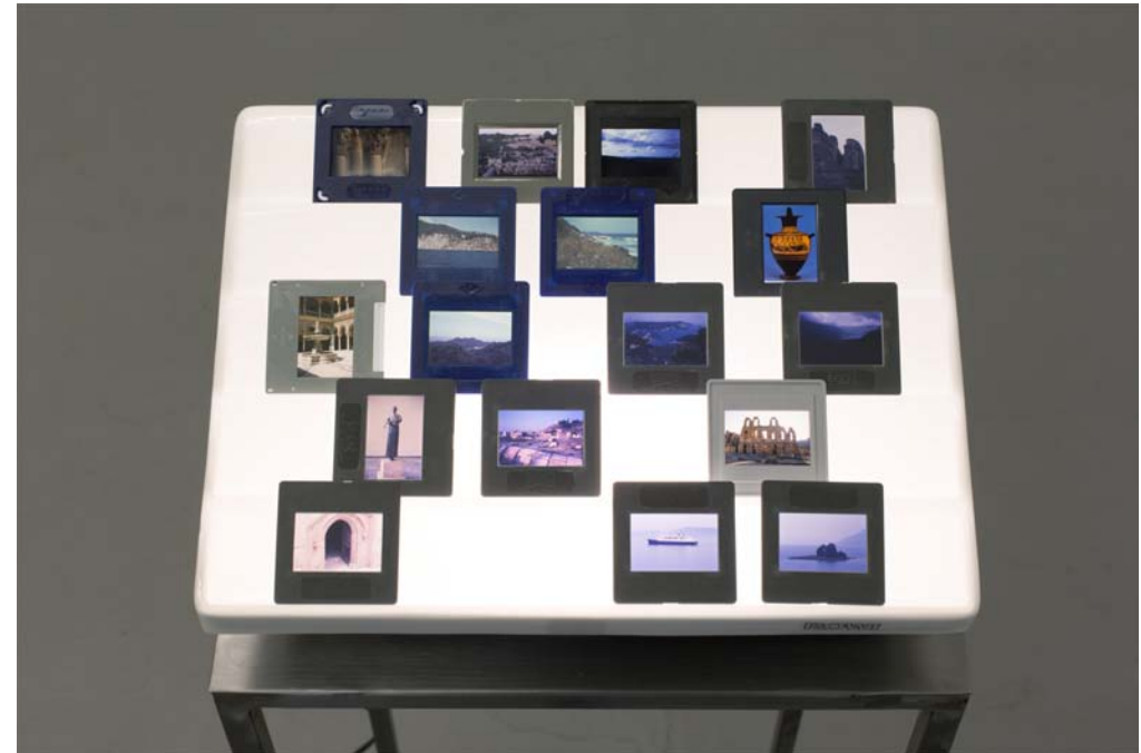
17 Slides , 2015, Dia display, 108 x 33 x 26 cm