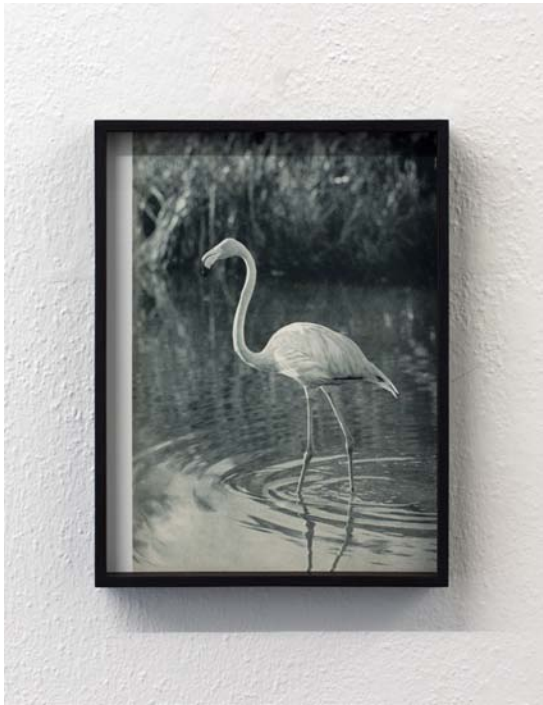
Der gewöhnliche Flamingo (Phoenicopterus ruber ruseos) , 2015, c-print, ed. of 5 + 2 AP, 31,4 x 23,7 cm framed