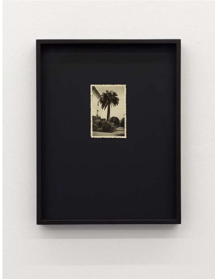
Isola Madre , 2015, silver gelatin print, unique, 31,4 x 24,4 cm framed