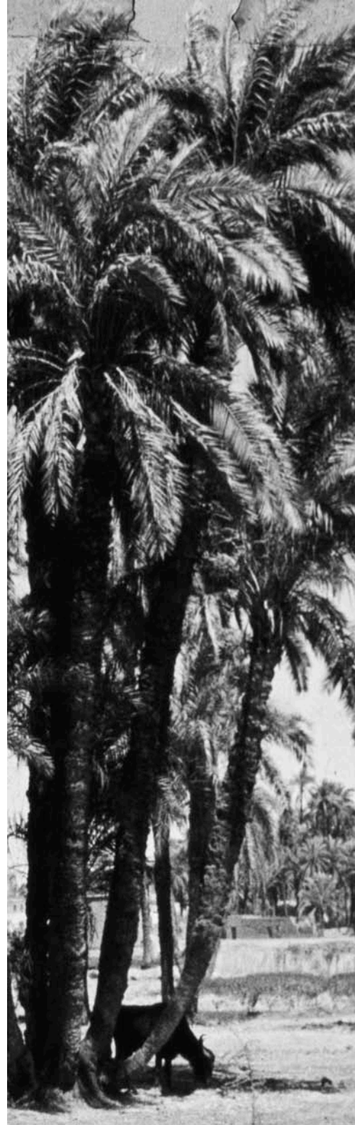
Palm Tree , 2015, c-print, ed. of 5 + 2 AP, 355 x 112 cm