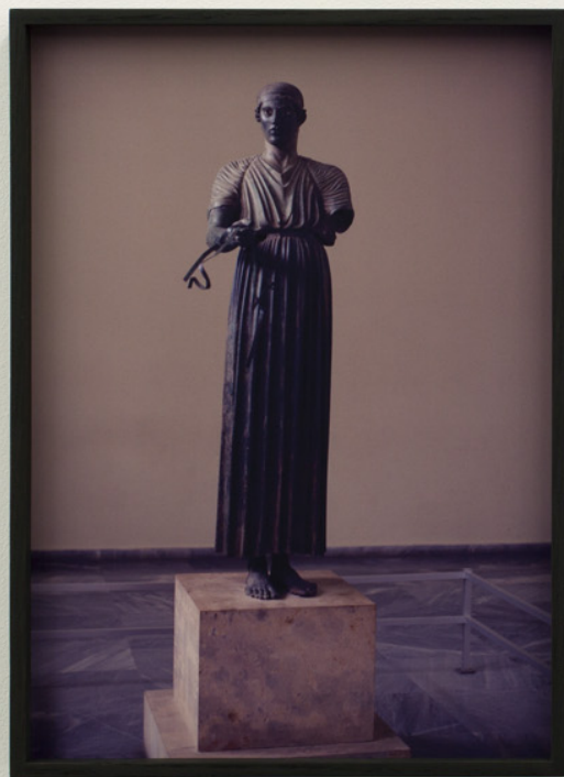
Untitled (Statue) #2 , 2015, c-print, ed. of 5 + 2 AP, 36,4 x 26,4 cm framed