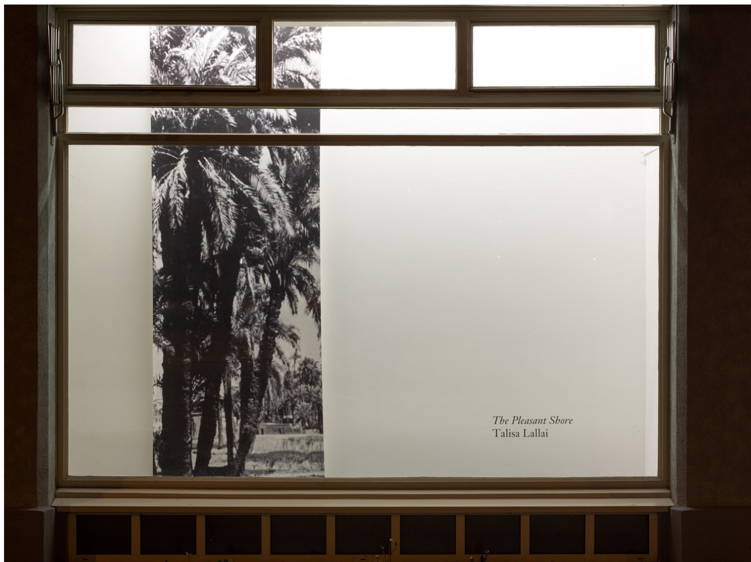
Palm Tree , 2015, c-print, ed. of 5 + 2 AP, 355 x 112 cm