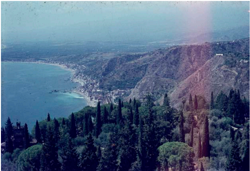
Untitled (Shore) , 2015, c-print, ed. of 5 + 2 AP, 33 x 47 cm framed