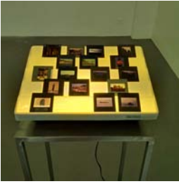
TALISA LALLAI 17 Slides, 2015 Dia display LALLA554451