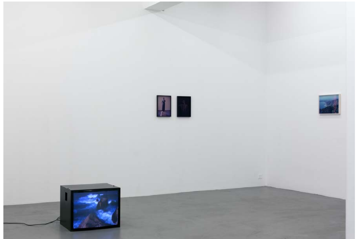
Installation view The Pleasant Shore