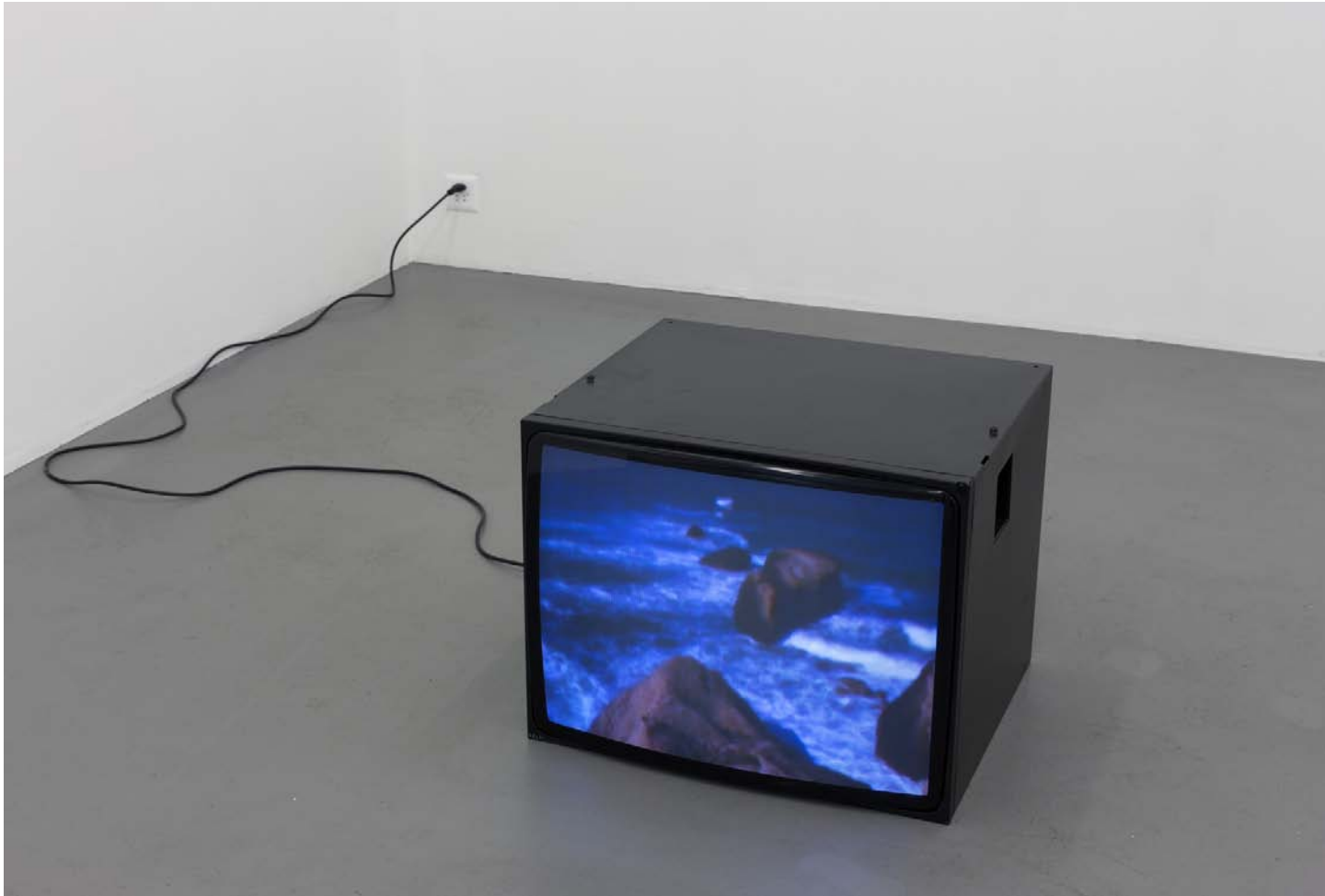
Untitled (Rocks) , 2014, digitalised 8mm video, ed. of 5 + 2 AP, 2 min. loop