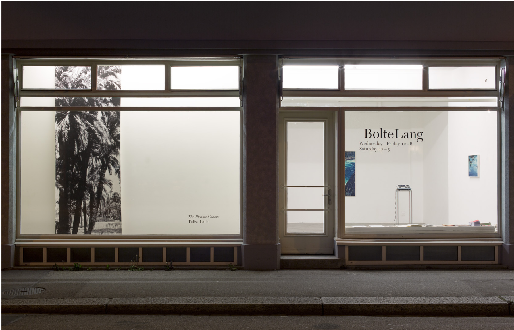
Installation view The Pleasant Shore