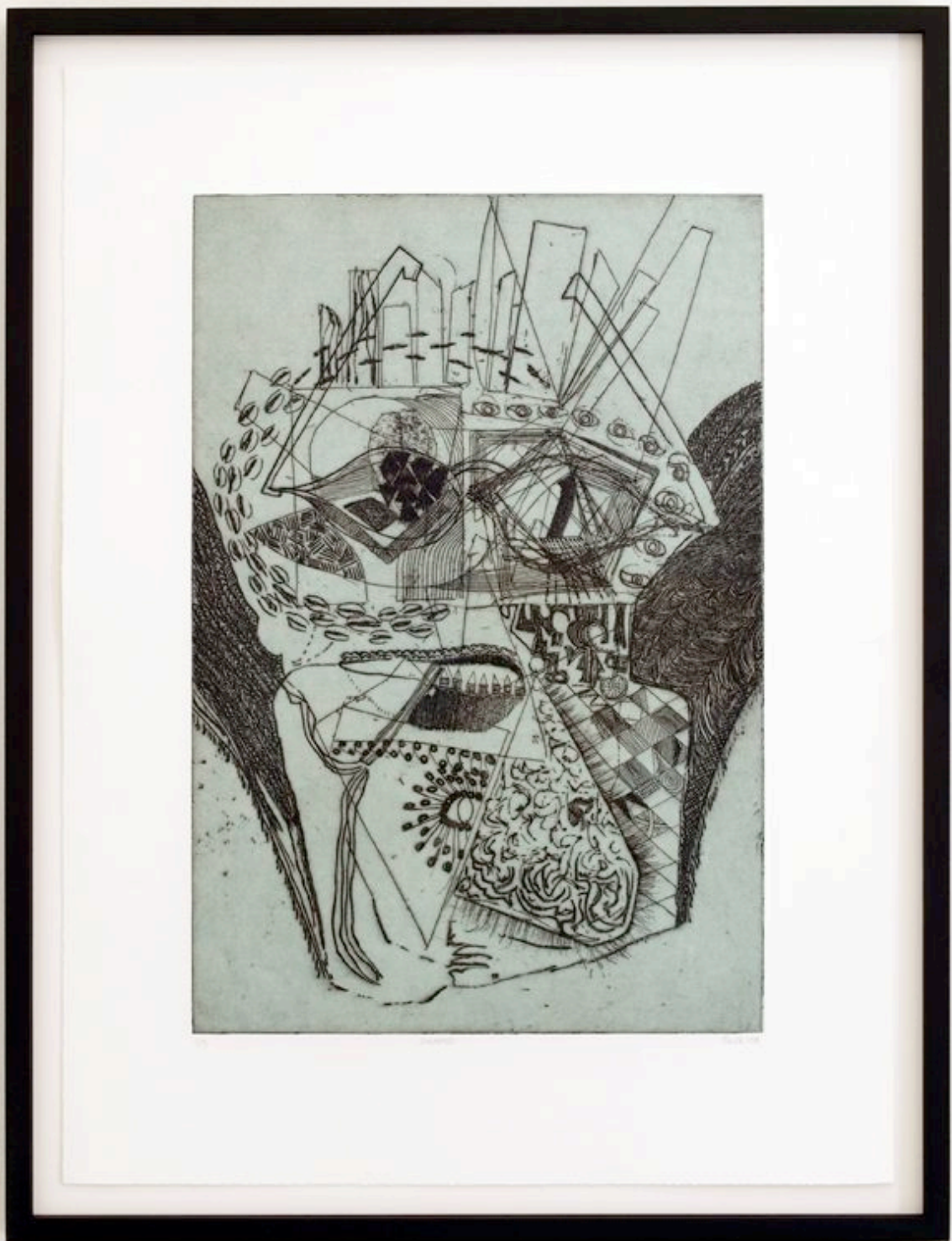
Peter Linde Buck, Disarmed , 2009 Hard ground etching on Somerset paper with chine-collé Edition of 5 + 2 AP, 50 x 34 cm £ 500 + £ 180 for frame