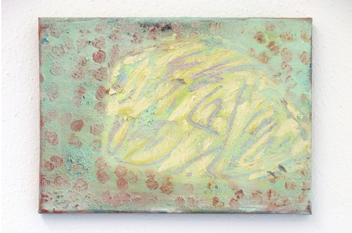
Gabriel Hartley, Avenue , 2009 Oil on canvas, 26 x 36 cm £ 1,300