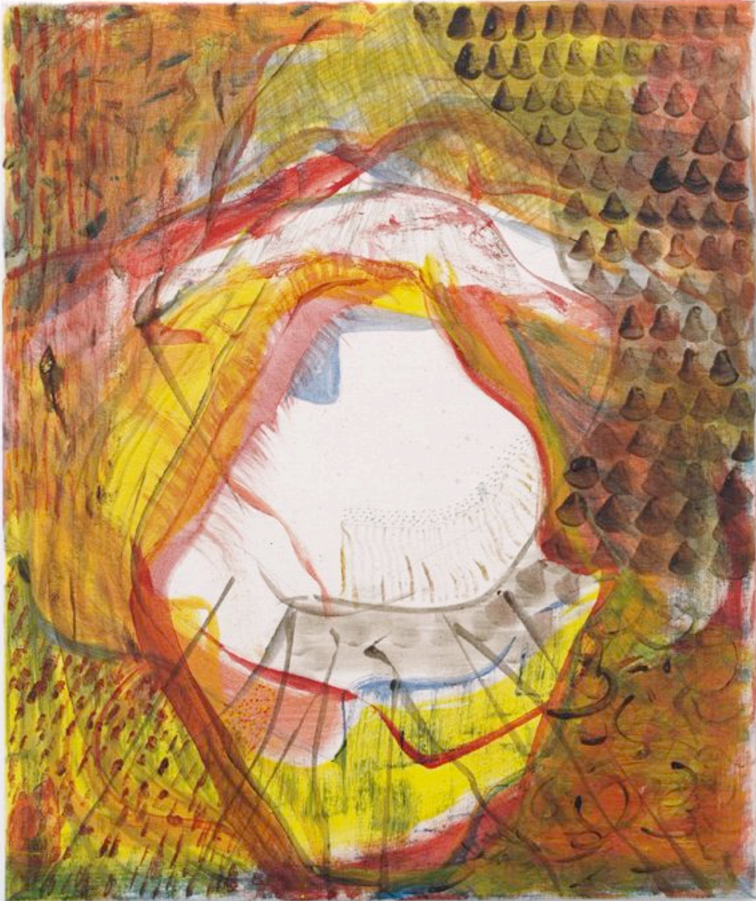
Peter Linde Busk, Skygge pulsen (The shadow pulse) , 2009

Acrylics on cotton duck canvas, 60 x 45 cm