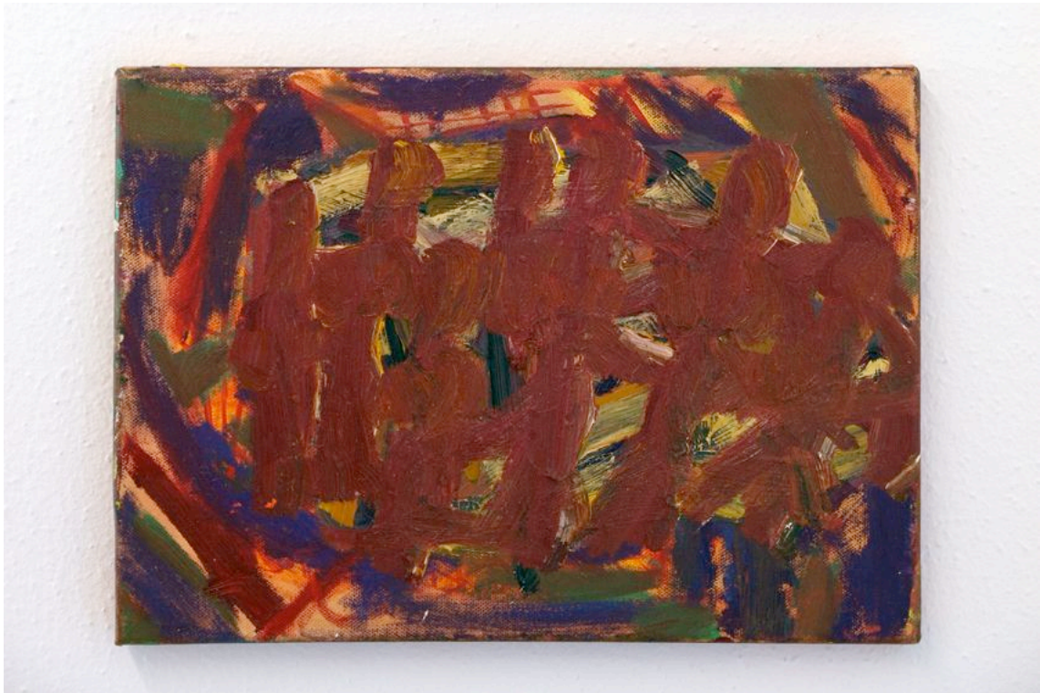
Gabriel Hartley, Band , 2009 Oil on canvas, 26 x 36 cm £ 1,300