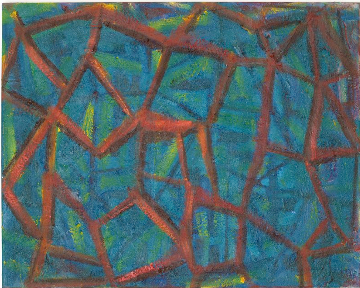
Gabriel Hartley, Crew , 2009 Oil on canvas, 76 x 61 cm £ 2,000