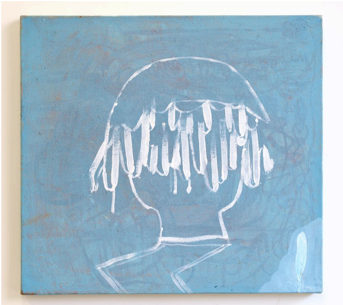
Joel Croxson, Porridge Bowl Head , 2009 Acrylic on canvas, 56.5 x 45 cm £ 1,500