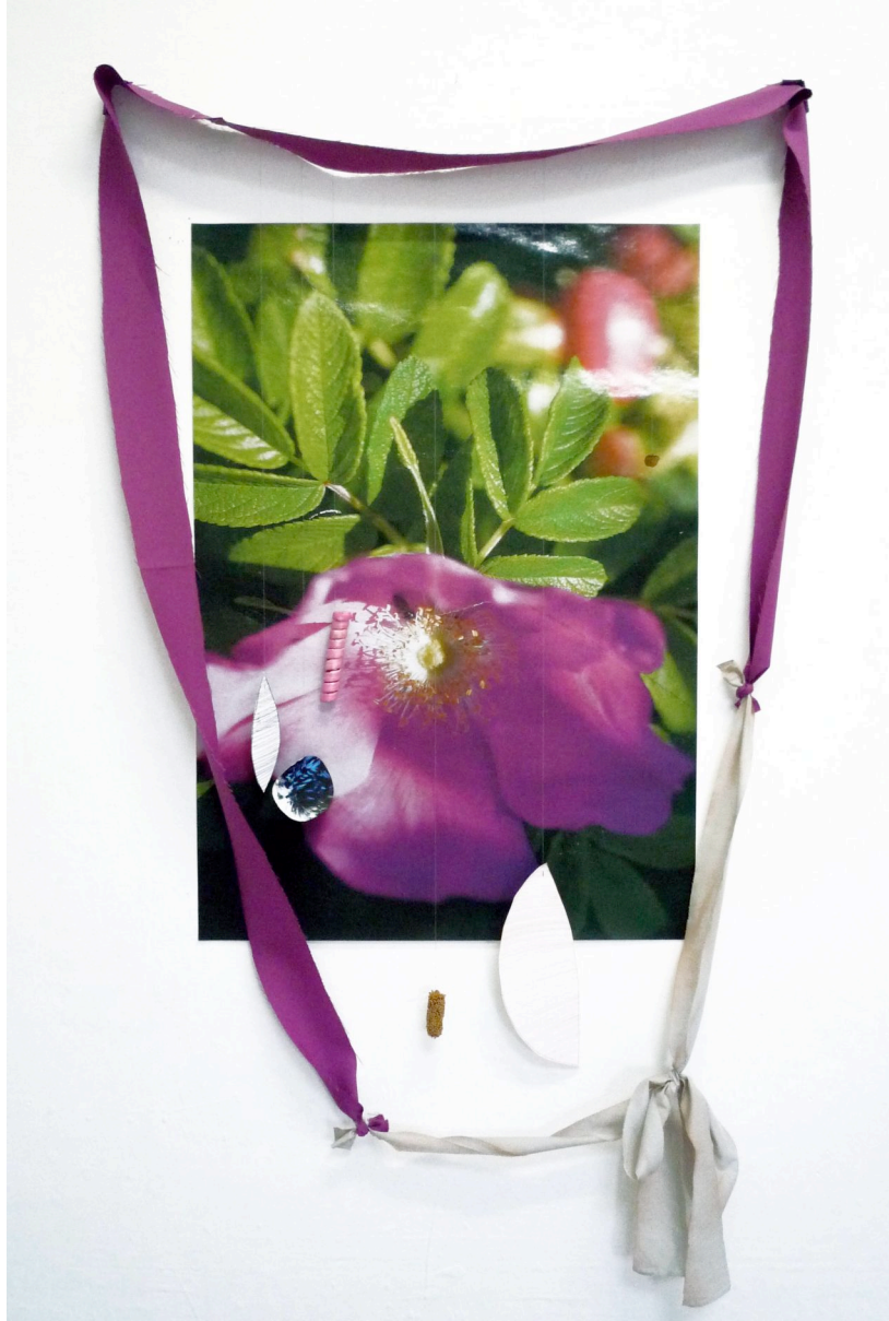
Laura Aldridge, (2) Preparations (you are a fucking inanimate object) , 2009 Poster print, fabric, paper, thread, button and potpourri, 160 x 85 cm £ 1,200