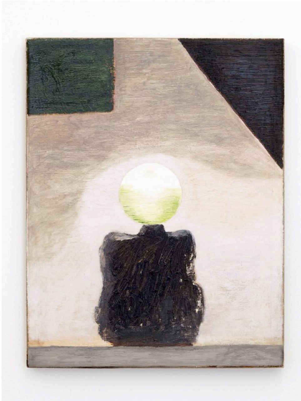
Sam Windett, Quarton #2 , 2009 Oil on canvas, 45 x 35 cm £ 3,200