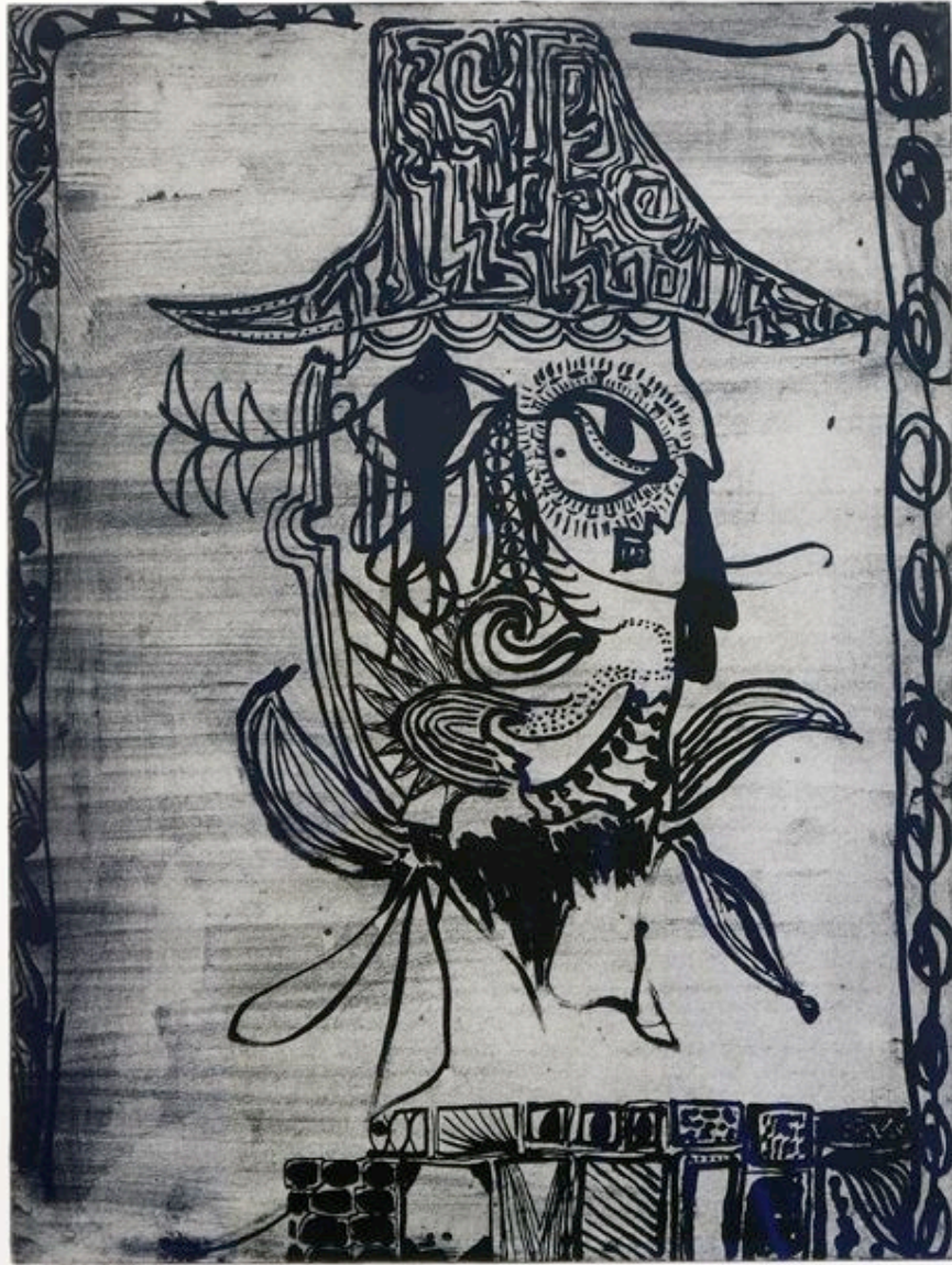
Peter Linde Buck, 60 watt silver lining , 2009 Hard ground etching on Somerset paper with chine-collé Edition of 5 + 2 AP, 50 x 34 cm £ 720 + £ 220 for frame