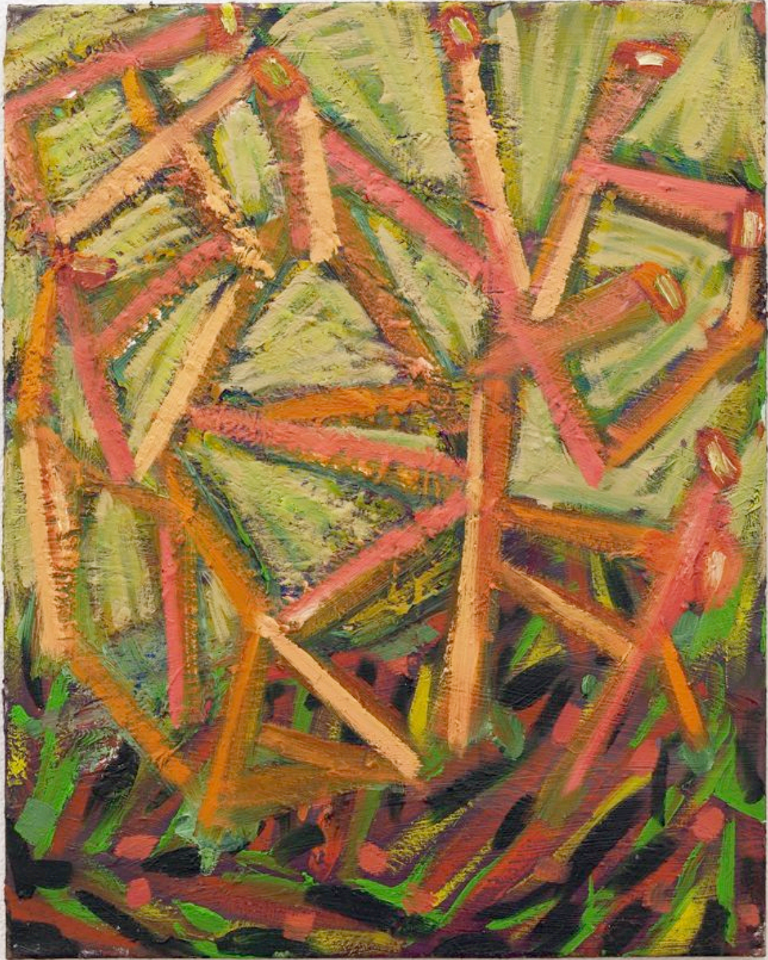
Gabriel Hartley, Bathers , 2009 Oil on canvas, 76 x 61 cm £ 2,000