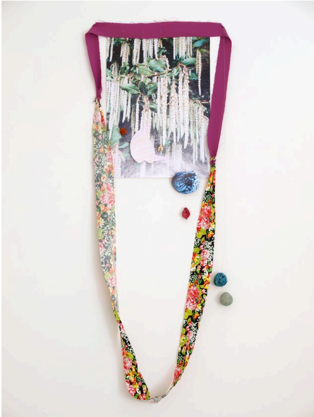
Laura Aldridge, (1) Preparations (you are a fucking inanimate object) , 2009 Poster print, fabric, paper, thread and potpourri, 180 x 60 cm