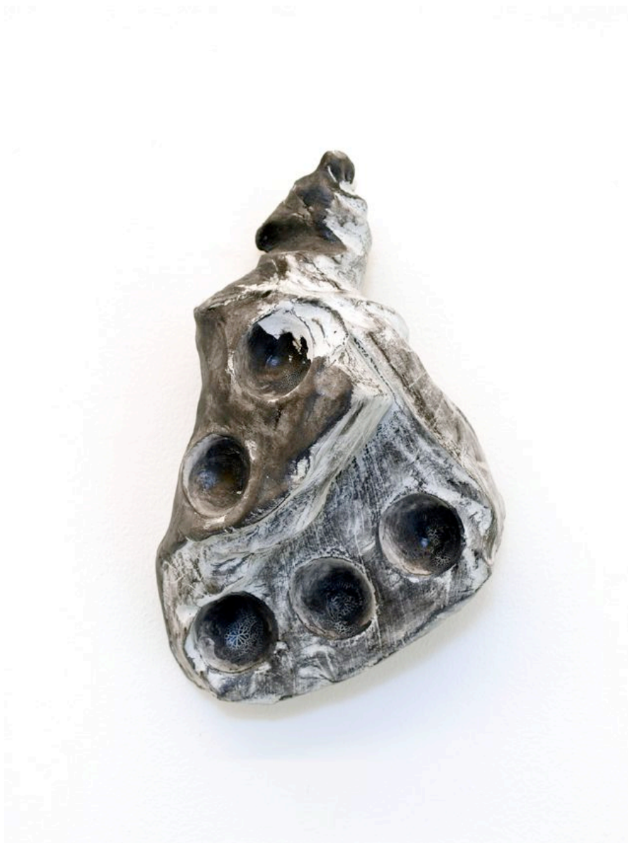
Erika Verzutti, Yin and Yang , 2009 Reinforced clay, charcoal, acrylic paint, watercolour paint, 26 x 18 x 11 cm $ 5,000