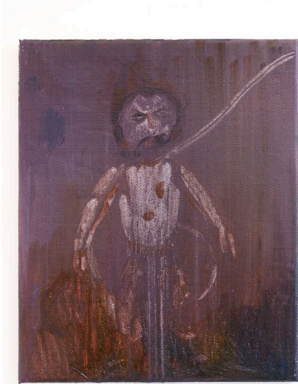
Joel Croxson, Untitled , 2009 Acrylic on canvas, 56.5 x 45 cm £ 1,500