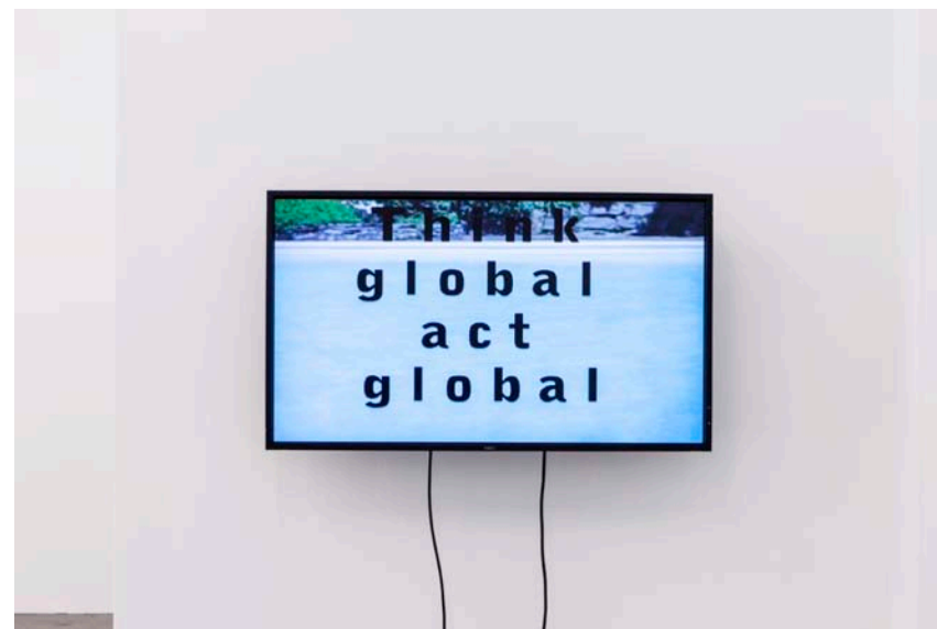
Henning Strassburger, Think global act global , 2012/2014, video, 3:26 min, Edition of 3