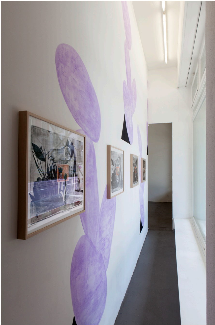
Charlotte Herzig, Cactus Accident , 2014, acrylic on wall, site-specific