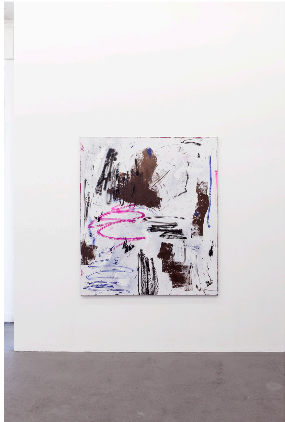
Henning Strassburger, No pun intended , 2014, oil and lacquer on canvas, 130 x 150 cm