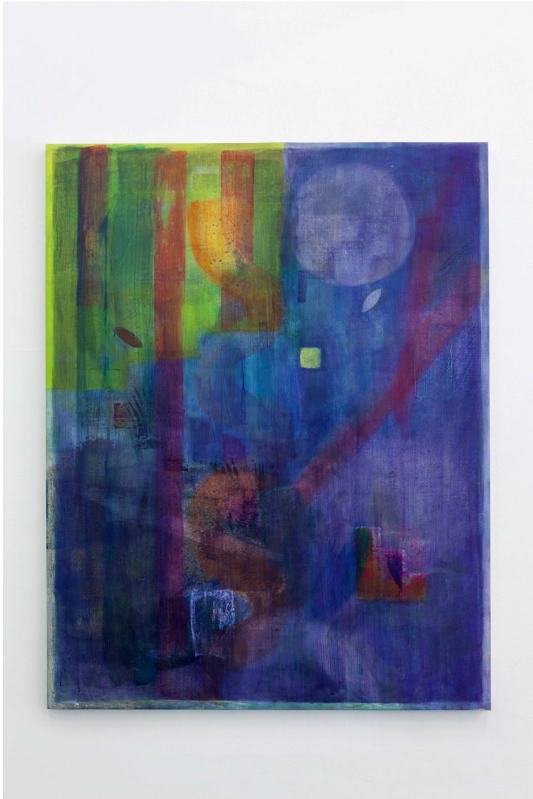
Charlotte Herzig, Flat Blue Fig , 2013, acrylic on canvas, 156 x 120 cm