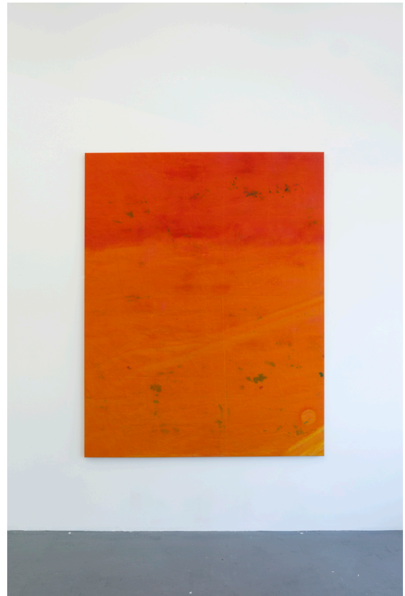
Tobias Spichtig, Orange , 2014, Epson Archival Ink painted on canvas, 190 x 150 cm