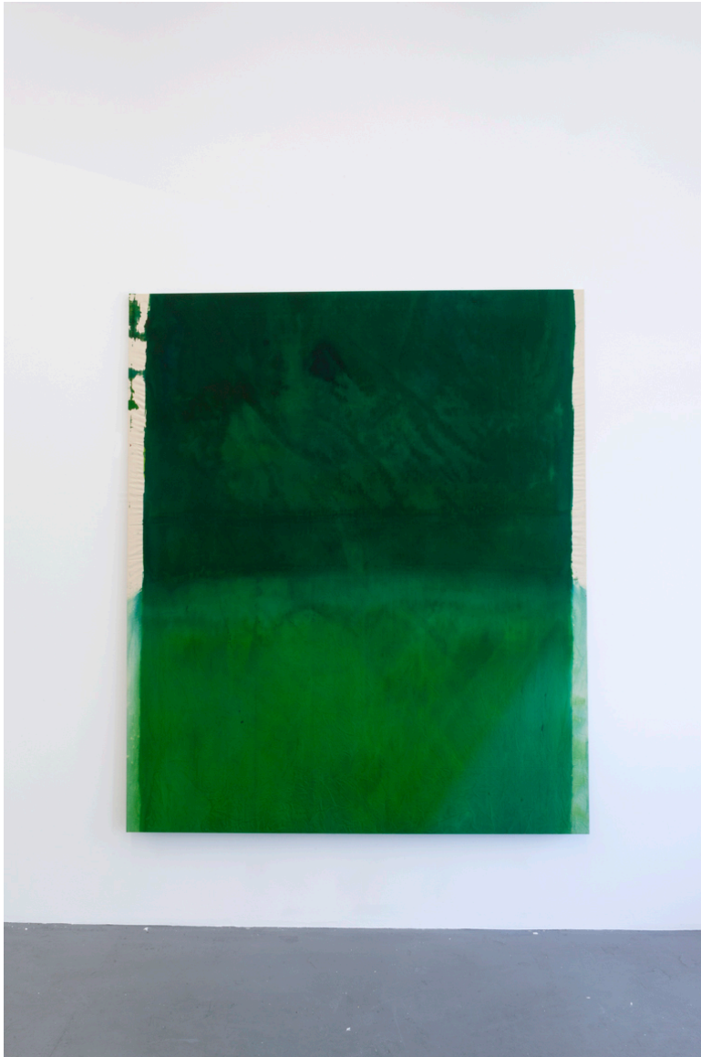
Tobias Spichtig, Green , 2014, Epson Archival Ink painted on canvas, 200 x 170 cm