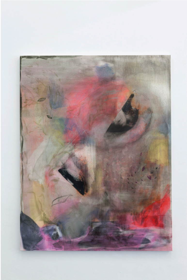
Charlotte Herzig, Blush , 2013, acrylic on canvas, 156 x 120 cm