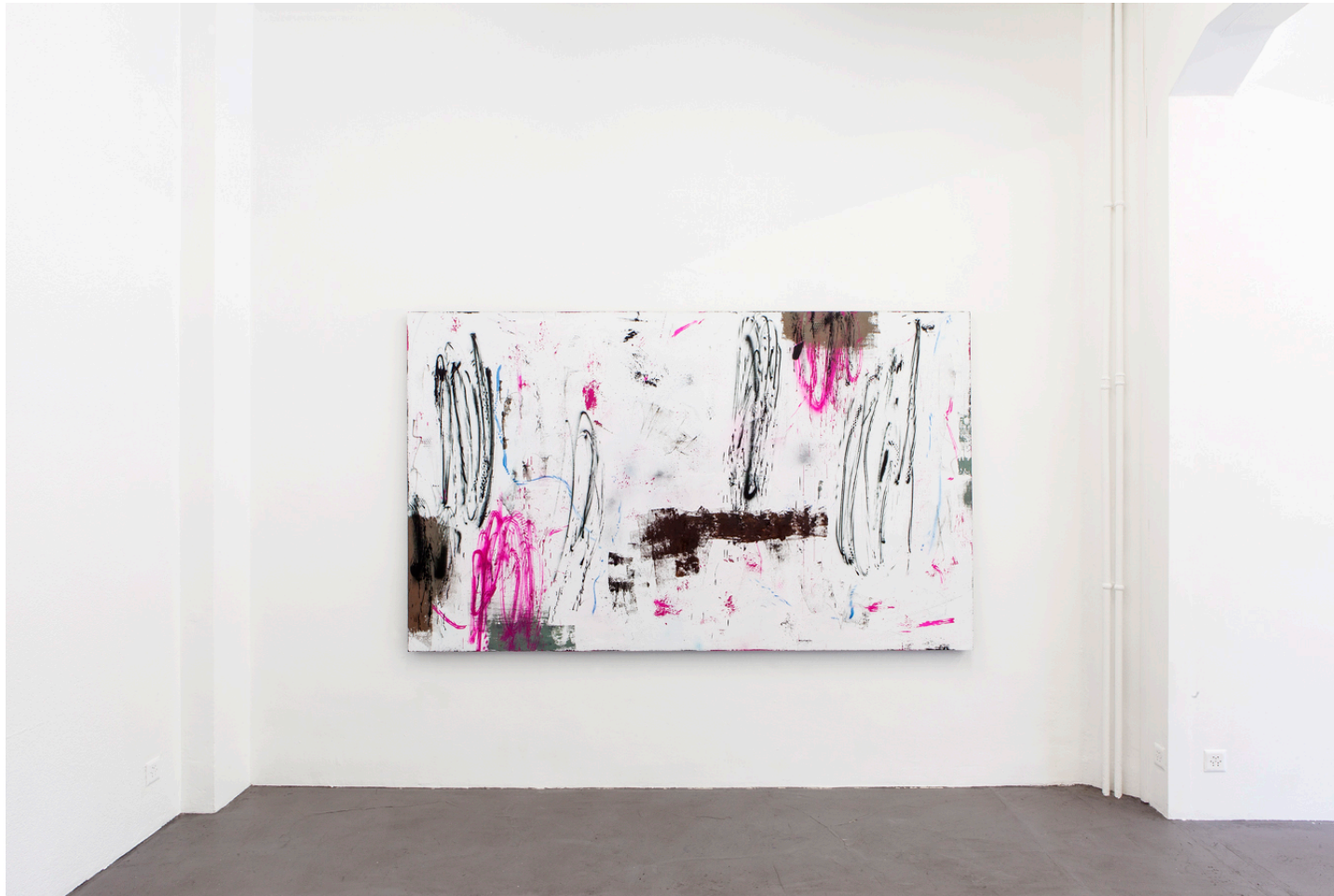
Henning Strassburger, Globally Globally , 2014, oil and lacquer on canvas, 150 x 250 cm