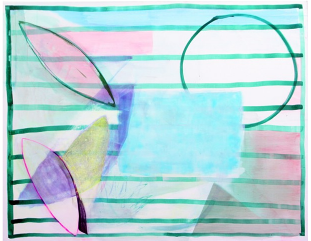
Charlotte Herzig, Mural View , 2013, acrylic on canvas, 156 x 120 cm