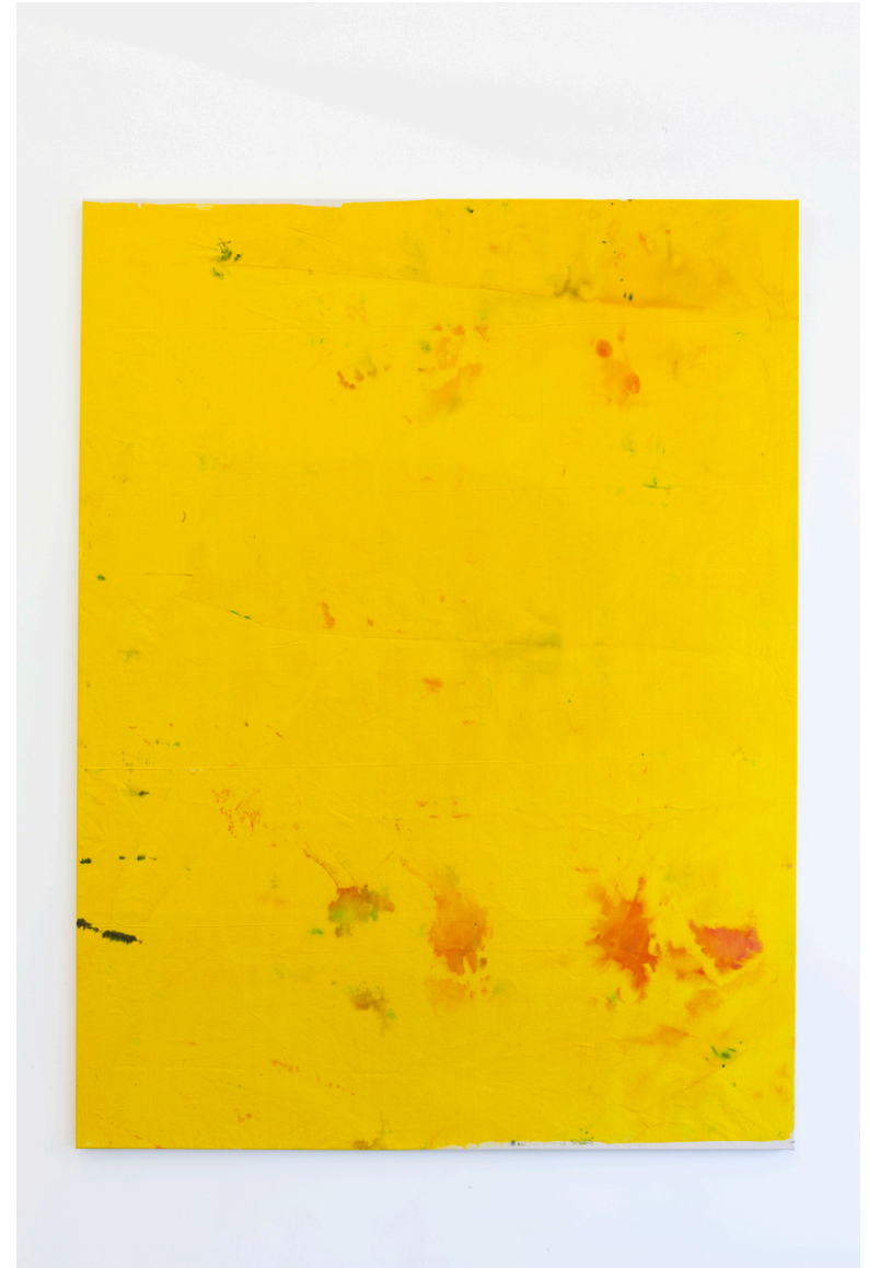
Tobias Spichtig, Yellow , 2014, Epson Archival Ink painted on canvas, 205 x 155 cm