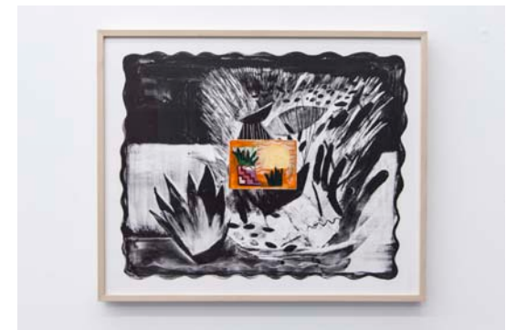
Charlotte Herzig, Miniature on landscape , 2014, b/w lithograph on paper, original chine collé watercolour, Ed. of 15 + 3 AP, 38 x 49 cm