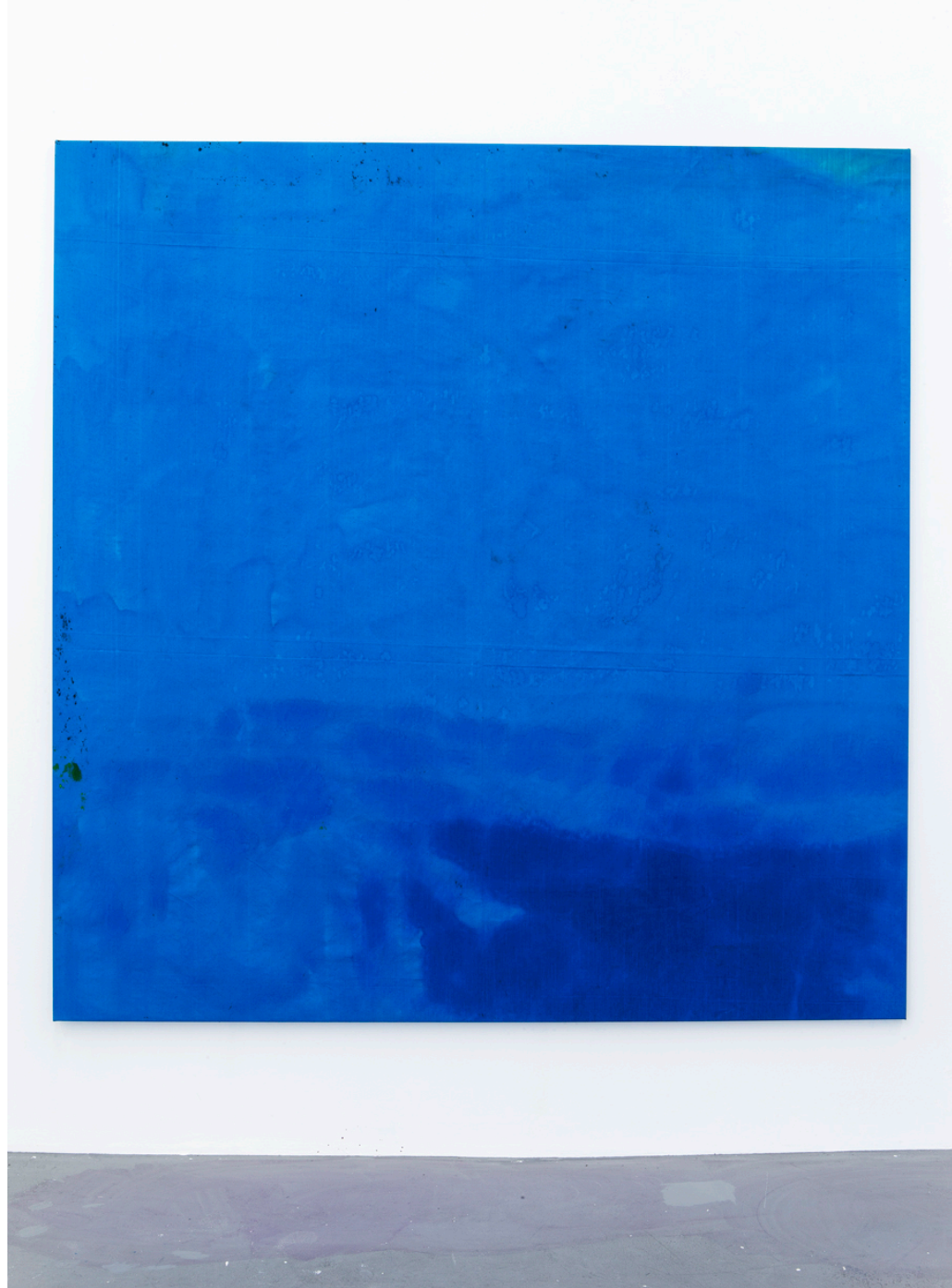
Tobias Spichtig, Blue , 2014, Epson Archival Ink painted on canvas, 205 x 200 cm