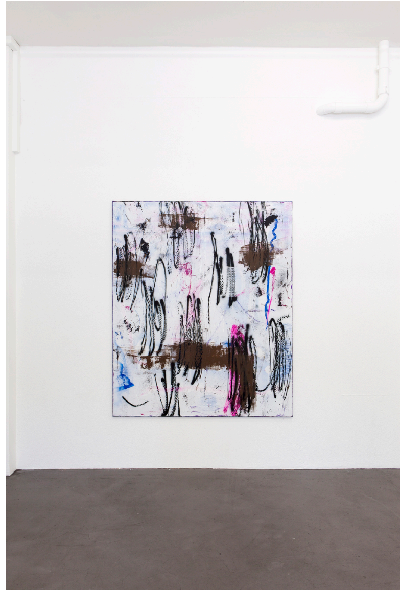
Henning Strassburger, So now , 2014, oil and lacquer on canvas, 180 x 150 cm