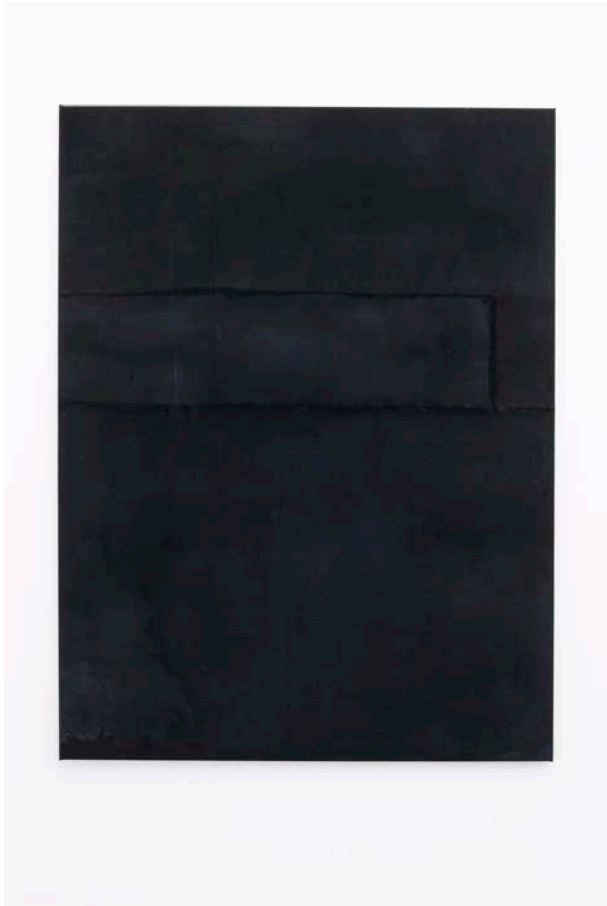
Tobias Spichtig, Black , 2014, Epson Archival Ink painted on canvas, 165 x 125 cm