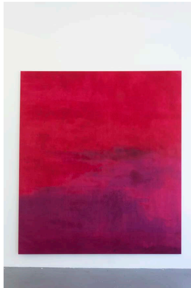
Tobias Spichtig, Red , 2014, Epson Archival Ink painted on canvas, 220 x 195 cm